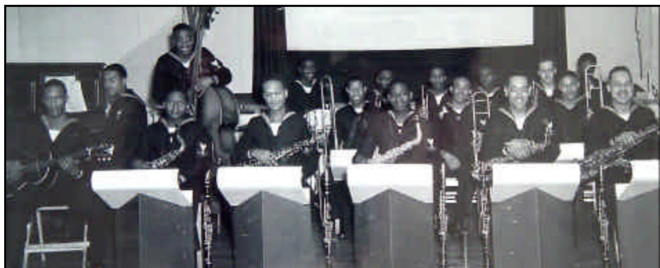
Hingham Naval Ammunition Depot Band.