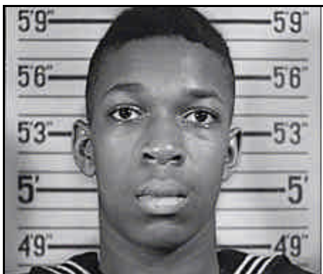
John Coltrane in the Navy.