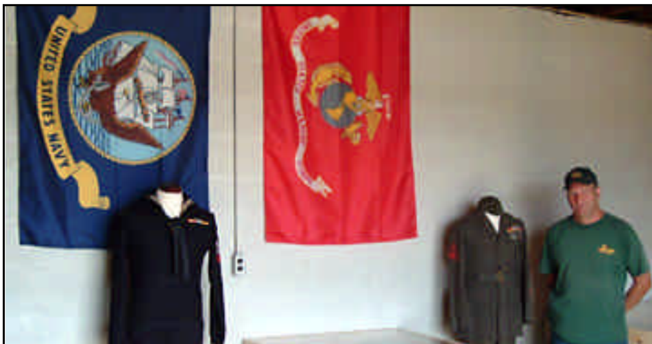
Park ranger Scott McMillan standing next to exhibit area in the dock house.