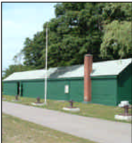
Bare Cove Park dock house exhibit center.